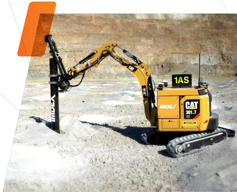
IMDEX-UFR METS Ignited project fund